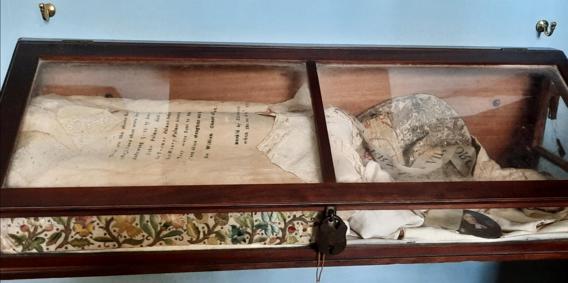
The bed clothes etc. of the miraculous triplets