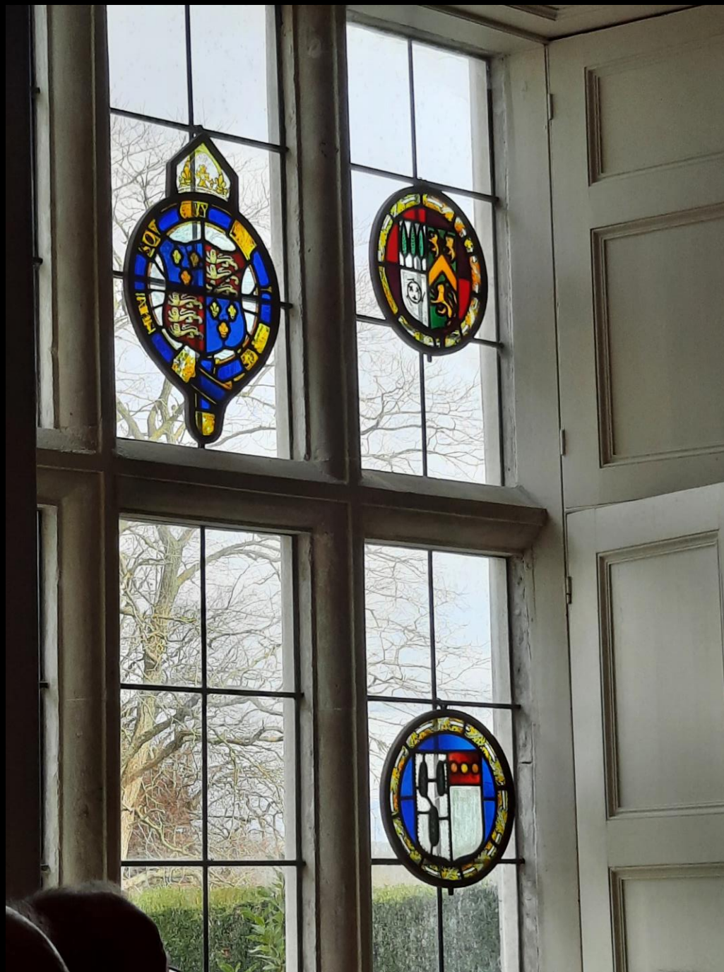
Coats of arms in windows – including the Verney ferns