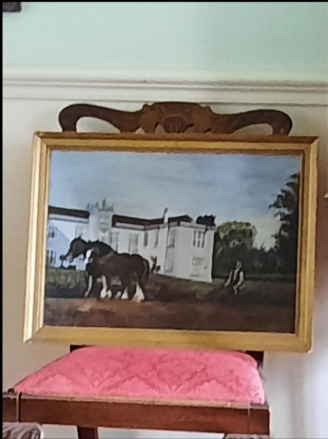
The picture painted by the Italian POW.