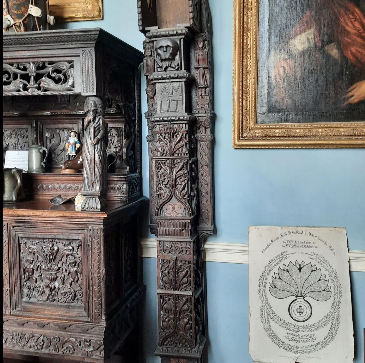
Interesting empty clock case – left from one of the recent forebears clock interest – date on side was 1600 something