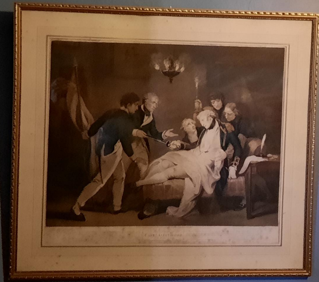
The death of one of the Samuels or Alexanders – following a successful assault (Mars vs Hercules)?? Can't recall details