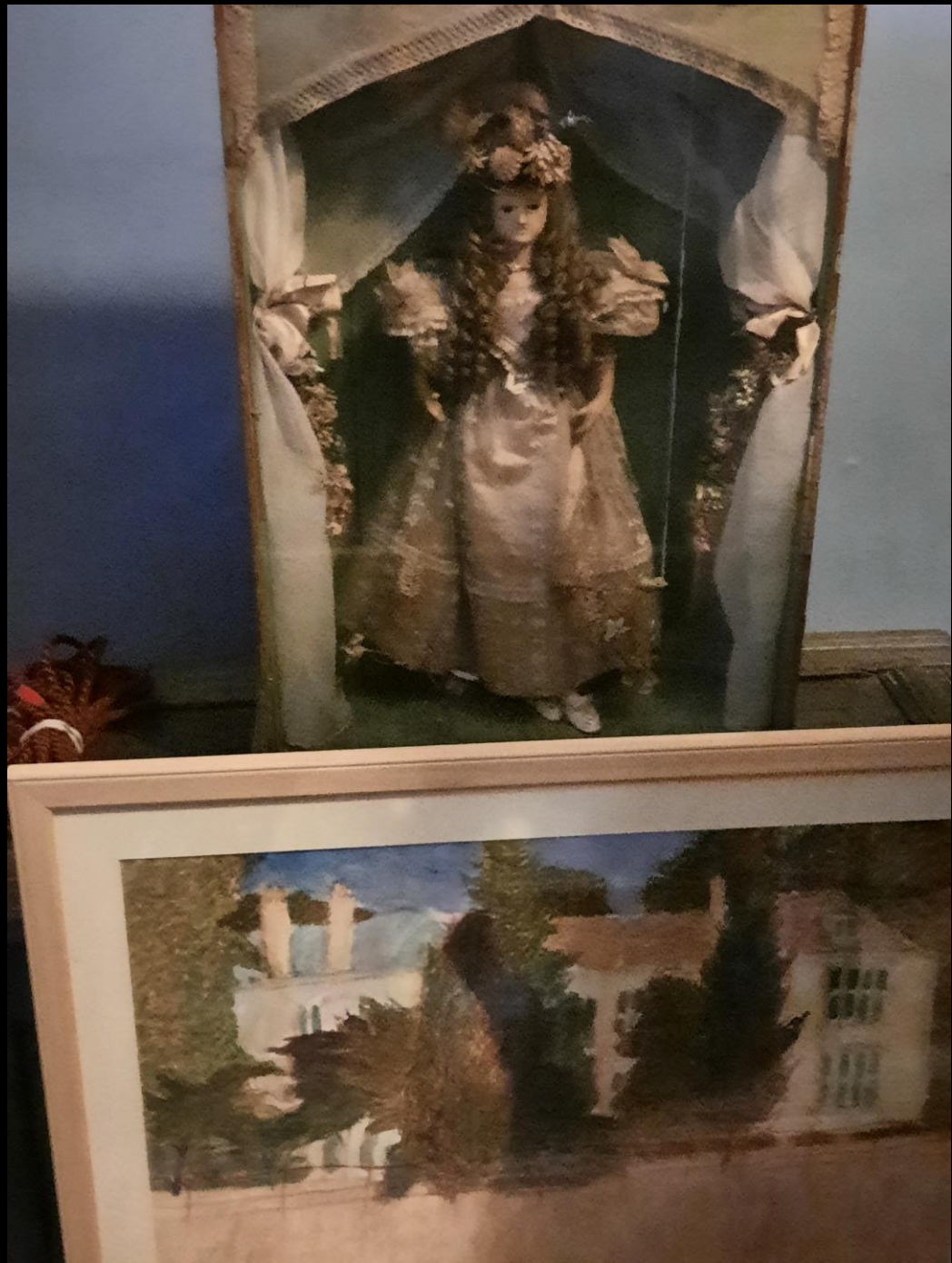
A rather lovely and very old china doll, and a rather good picture of the House by a relatively well-considered artist – all in the old entrance back lobby out of the light