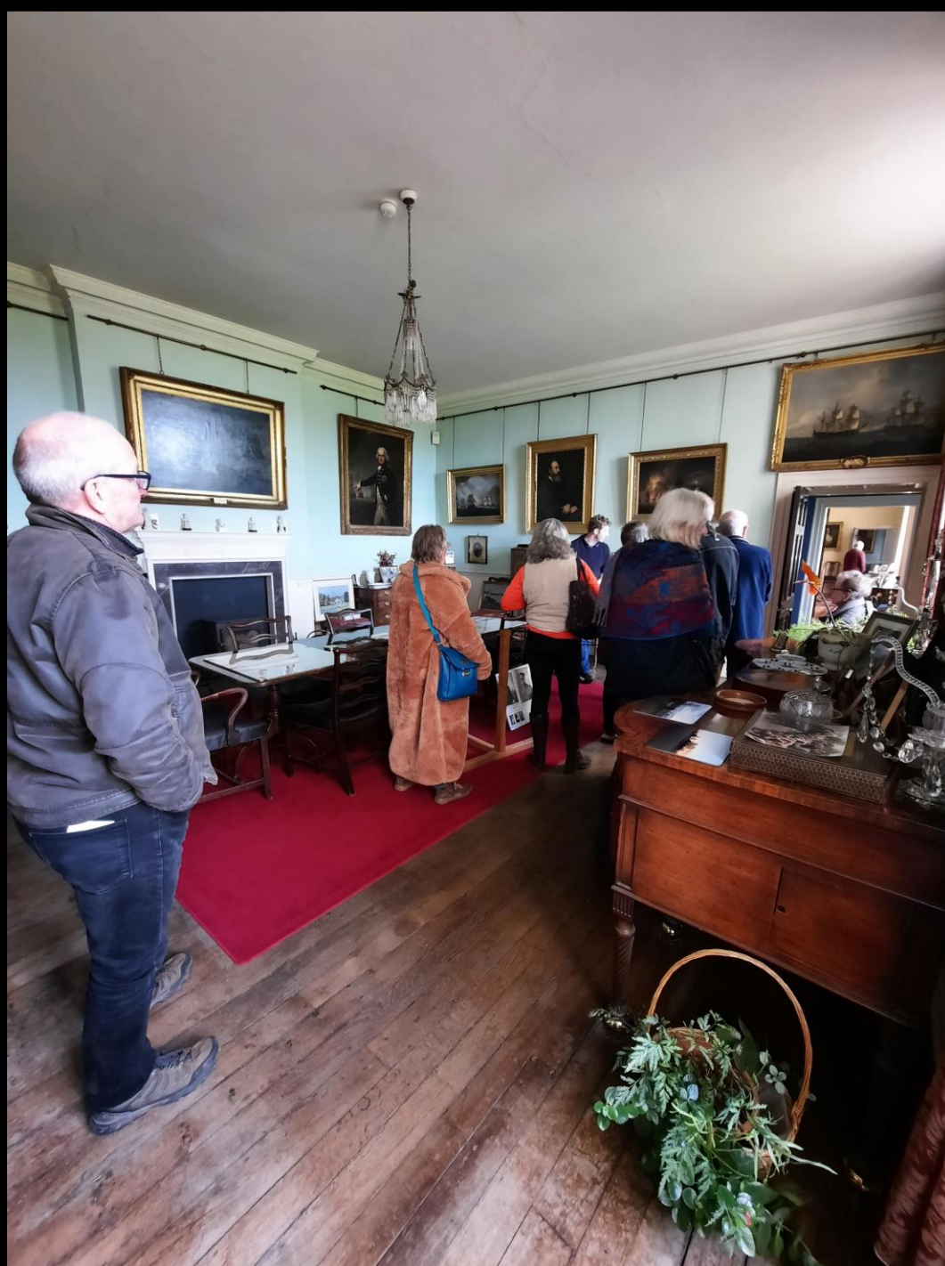
The dining room.