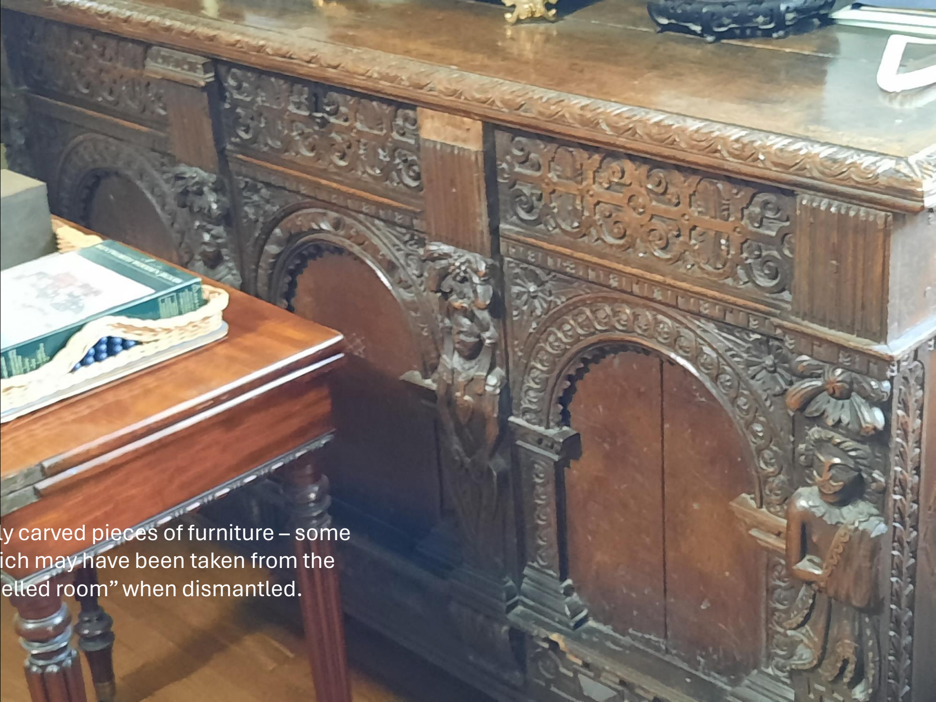
Richly carved pieces of furniture – some of which may have been taken from the “panelled room” when dismantled.