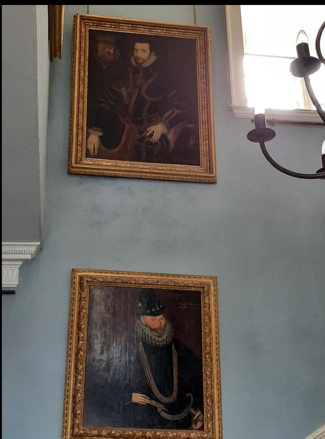
Portraits of Elizabethan adventurer – including Hawkin – I forget the other's name